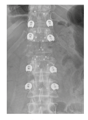
X-ray, AP view 360° nearly metal-free thoracolumbar stabilization with KONG®-TL VBR E and tantalum markers, attached to the inserter VADER® Pedicle System