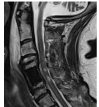
Postoperative MRI, sagittal view icotec Anterior Cervical Plate and KONG®-C VBR M showing complete decompression